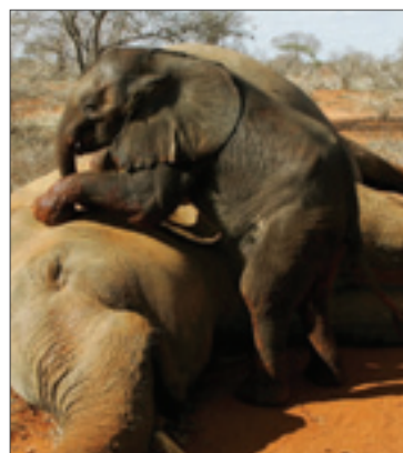
David Shepherd Wildlife Trust

At its recent meeting in Geneva, the Convention on International Trade in Endangered Species of Wild Fauna and Flora (CITES) unfortunately voted to designate China as an ivory trading partner and gave final approval for the sale of nearly 240,000 pounds of ivory (obtained from an estimated 11,000 dead elephants) from South Africa, Botswana, Namibia, and Zimbabwe.