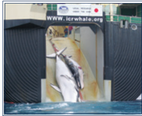
Japan tries to justify its Antarctic whaling program as satisfying “research” needs, but the program is commercially driven, with the meat being sold in supermarkets and restaurants.

Instead of letting the coffin close on this despicable industry, the US is giving it new life by attempting to assuage Japan and prevent it from following through on its baseless threats to leave the IWC. Sadly, many countries have been duped into subscribing to this plan instead of boldly opposing the actions of these rogue whaling nations by using all domestic and international tools available to compel them to embrace the will of the majority. Finally, instead of