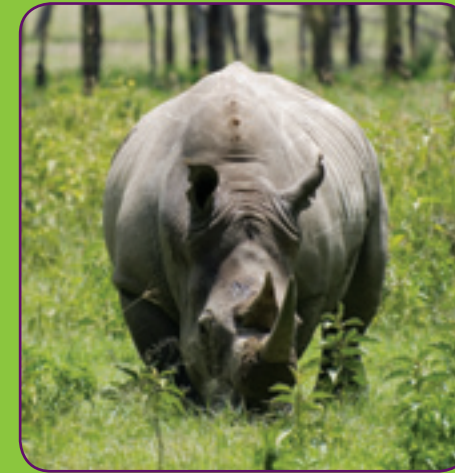
Lake Nakuru National Park, Kenya

Restricted in the wild to Garamba National Park in the Democratic Republic of Congo, poaching reduced the Northern white rhino's population to only four confirmed animals by August 2006. "Worryingly, recent fieldwork