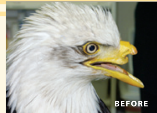
A titanium upper beak prosthesis is being fashioned for Beauty the eagle, who lost the appendage after being shot by a poacher. Currently, she wears a nylon composite beak that allows her to feed herself.