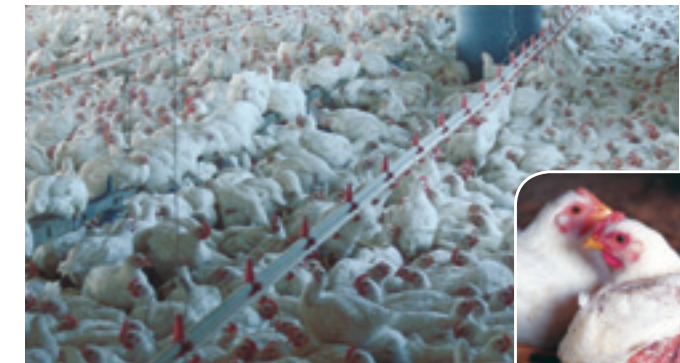
The conditions under which Tysons raises its chickens are anything but “natural.”