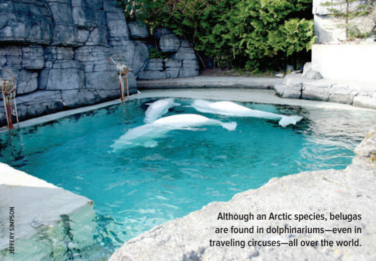
Although an Arctic species, belugas are found in dolphinariums—even in traveling circuses—all over the world.

Imagine being forced to live your life in a small windowless room devoid of anything or anyone familiar to you. That's what faces a dolphin or whale captured from the wild for display in a zoo or aquarium—violently taken from his or her family or social group, and confined in a concrete tank or netted pen with no hope of ever being returned to the wild or leading a natural life.