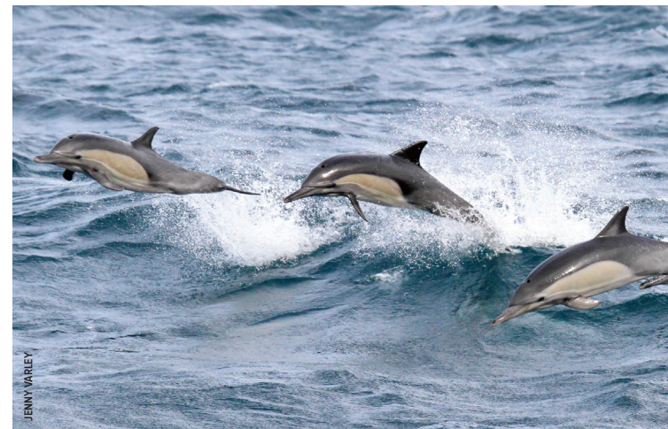
Wild dolphins can travel up to 100 miles a day. In contrast, the minimum dimensions for a tank containing two bottlenose dolphins in the United States are just 24 feet in length and 6 feet in depth.

In the Japanese town of Taiji, around 2,000 cetaceans may be killed in this manner every year. But the most lucrative targets of these drive hunts are actually the animals "spared" from the slaughter. Show-quality dolphins are sold—for as much as US$150,000 each—to captive display facilities in Japan, China, the Middle East, the Caribbean, and elsewhere. The captivity industry effectively keeps the drive hunts going.