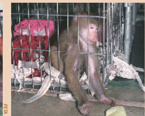
A lion languishes in a cage on concrete floors with wire fencing and no psychological stimulation or companionship (left); A caged bear, living in solitude, stares out from his barren cage in someone’s backyard (middle); This lone baboon in a traveling animal show lives amidst little more than plastic crates and shredded newspaper (right).