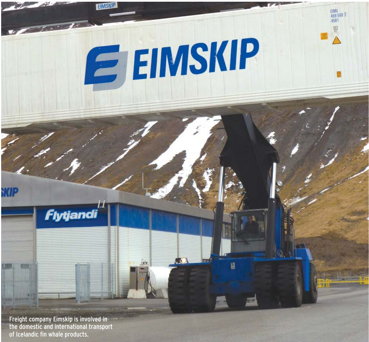
Freight company Eimskip is involved in the domestic and international transport of Icelandic fin whale products.