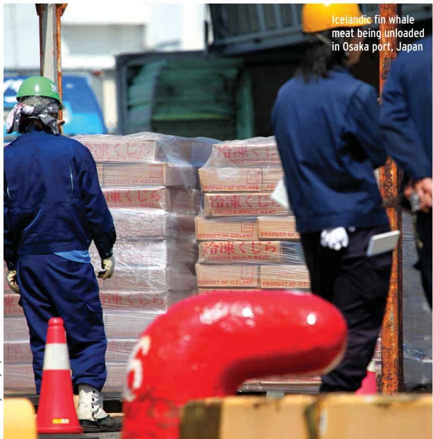
Icelandic fin whale meat being unloaded in Osaka port, Japan