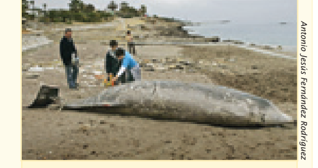
This Cuvier's beaked whale is one of four who stranded in an atypical mass stranding event in Southern Spain.

caused] acoustic activities, most probably anti-submarine active mid-frequency sonar used during the military naval exercises." Our European colleagues are now urging British authorities to provide precise information about the location of the Kent and its sonar use on the stranding date.