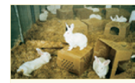
AWI's new book on refinement and enrichment for rodents and rabbits demonstrates optimal bedding and foraging materials for these animals (see story, page 19).