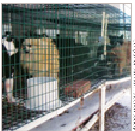
All commercial breeders of dogs and cats should be inspected by USDA.