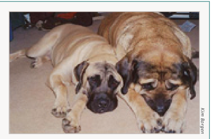
Bubba and Savannah were shot and killed after being caught in steel-jaw leghold traps.