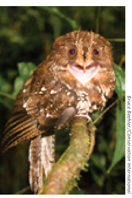
The feline owlet-nightjar is among the many newly discovered and rare species found in New Guinea.

INDONESIA Living in a time when we hear so much about lost species, it's refreshing to learn that dozens, if not hundreds, of new species of frogs, butterflies, mammals, flowers and birds were discovered earlier this year by an international team of scientists in the remote mountain rainforests of Western New Guinea. Many rare species were also sighted, among them tree kangaroos, spiny anteaters and long-beaked echidnas, as well as male bowerbirds performing elaborate courtship rituals. One scientist is reported to have said that the "dawn chorus" of birds was the most fantastic he had ever heard. The most remarkable find was the Berlepsch's six-wired bird of paradise, thought to have become extinct in the 19<sup>th</sup> century when their feathers were coveted for women's hats.