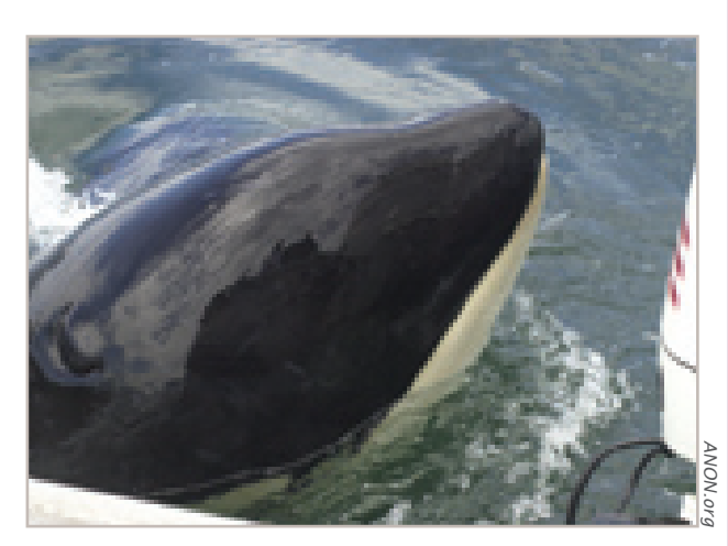
Luna, a playful orca whale separated from his pod, was known for interacting with humans.

Shortly after gaining an endangered status with other orcas living around the Puget Sound, Luna the whale was killed by the propellers of a tugboat in March. He was famous for interacting with boats and local people when he first became lost in Canada's Nootka Sound five years ago, and that never changed. Believing he held the spirit of their former chief, members of the local Mowachaht/Muchalaht tribe bonded with the whale (AWI Quarterly, winter 2005). Luna, who was known to play on boat wakes, swam under a tugboat and collided with a propeller powered by a 1,700 horsepower engine. However, this was not his first boat strike. In 2003, the whale was hit by a smaller propeller-but fortunately, he survived. This led to increased efforts to protect Luna, but in the end, he could not be saved.