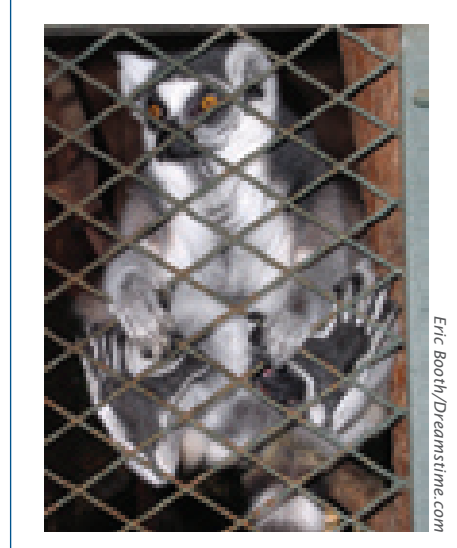
The ring-tailed lemur is one of over 7,000 primates who were trafficked in the last half-decade between Mexico and other countries. The ban on imports and exports will help these animals receive the protection they deserve.

"Primates are abused in so many ways, mostly in places frequented by tourists, such as Acapulco or Cancun," Alaniz said. Chimpanzees, macaques, baboons and squirrel, capuchin and titi monkeys are trafficked all over the world. Sadly, these wild animals were often brought to Mexico to be used as pets to draw the attention of tourists. "In many cases, monkeys are given alcohol to make people laugh. Most live with a rope or chain tied around their necks, and few are fed their natural foods," she explained. "Some live their whole lives in small cages. Others are used in circuses all over the country."