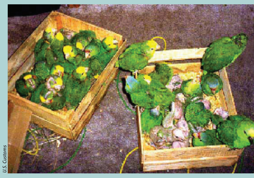
Lilac-crowned and yellow-headed amazon parrots smuggled into the United States from Mexico.

The spectacle of wild parrots is now an enormously popular ecotourism attraction and generates millions of dollars annually for tropical nations. Tourism creates solid employment for indigenous people as guides and lodge operators, and, if implemented well, ecotourism facilitates the long term protection of natural areas. The international attention that comes along with the tourism also builds local pride in natural heritage, which further facilitates nature conservation. In contrast, harvesting parrots for the pet trade provides small numbers of temporary jobs, and the financial benefits fall primarily in the hands of unscrupulous dealers in large cities rather than indigenous people.