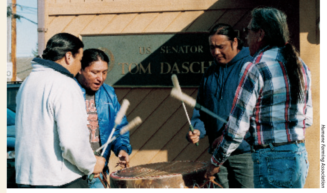
Rosebud Sioux tribal members participate in a drum circle at a press conference outside U.S. Senate Minority Leader Tom Daschle's Rapid City office to protest construction of a giant hog factory.

However, Smithfield's "fix" is swirling in a larger vortex. Unemployment has reached 20%: much of Poland is locked in a situation reminiscent of the great depression of the 1930s. The top down corruption of the post-communist government was revealed when a secretly recorded conversation, soliciting a bribe of $17.5 million to SLD in return for passage of a radio and television bill favorable to commercial interests, was published in Poland's largest daily newspaper. Public support for the government has plummeted to 12% in the polls. A vote of confidence has been put off until after the June referendum on E.U. accession. Once this is over, the government will probably fall, new elections will be called, and opposition parties (including Samoobrona, now polling far ahead of SLD) will dominate the Sejm. Opposition parties decry corruption and promise Poland for Poles. The question upon which Poland's future depends is whether they can put words to practice.