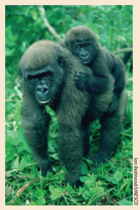
A young gorilla rides "piggy back" in a National Park in the Republic of Congo.