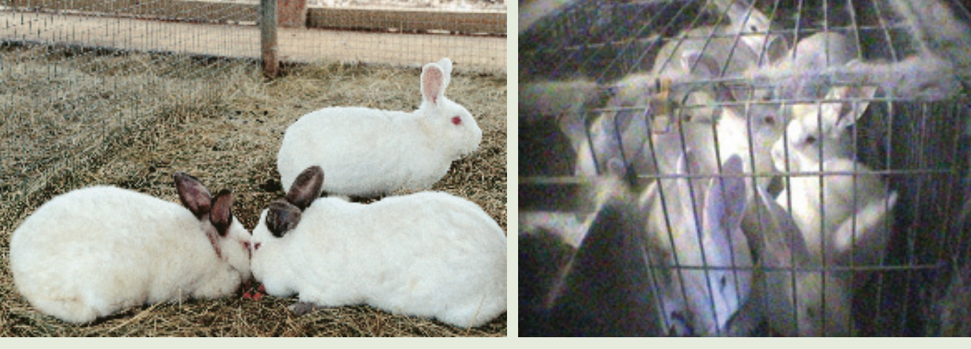
Left: Rescued rabbits reside at the Fund for Animals' Rabbit Sanctuary. Right: Rabbits, who instinctively run and dig, are confined in factories to wire mesh cages and subjected to artificial lighting to increase production.