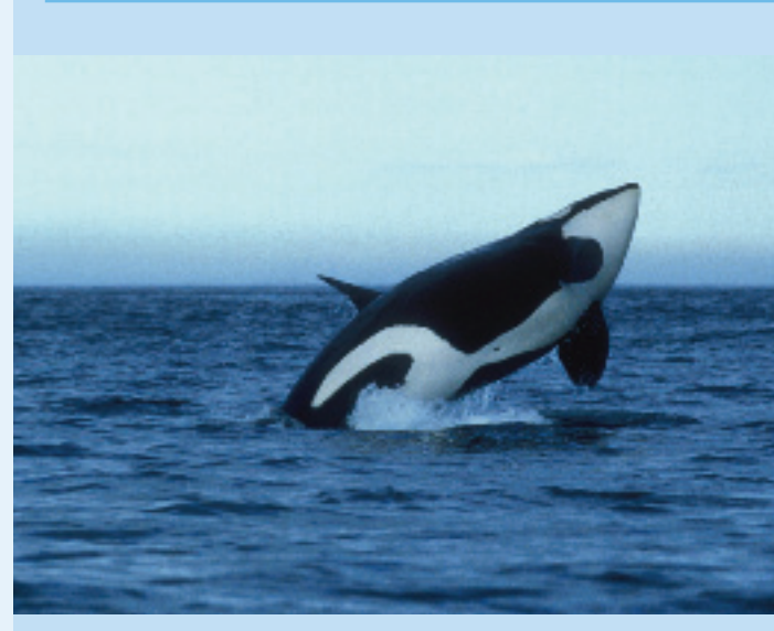
A breaching orca is one of the most dramatic sights in the cetacean kingdom: photographed here off of the rugged Kamchatkan coastline.

The Russian government has set a quota for the capture of up to ten Orcas from its waters for 2003. Any Orcas captured are likely to be exported abroad for display in marine parks or aquariums. Please help our efforts to stop captures of Orcas in Russian waters by writing a polite letter to: Vitaly G. Artyukhov, Minister of Natural Resources, Bolshaya Grouzinskaya Street, 4/6, 123812 Moscow, Russian Federation.