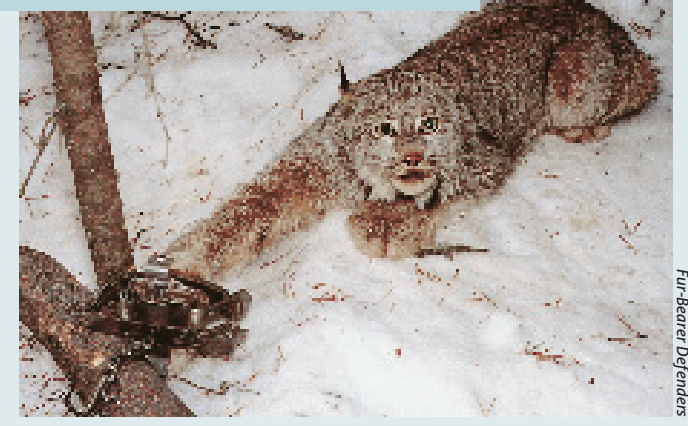
H.R. 1800 prohibits the interstate and foreign commerce in furs from animals caught with steel jaw leghold traps as well as shipment of the traps themselves. The U.S. must ban these tools of torture.

To implement this agreement and uphold our international obligations, Congresswoman Nita Lowey (D-NY) has introduced H.R. 1800, to stop the use of steel jaw leghold traps in the U.S. It's high time that the U.S. join the 88 other countries that prohibit this awful trap.