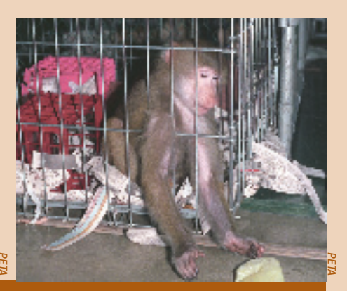
A lion languishes in a cage on concrete floors with wire fencing and no psychological stimulation or companionship (left); A caged bear, living in solitude, stares out from his barren cage in someone's backyard (middle); This lone baboon in a traveling animal show lives amidst little more than plastic crates and shredded newspaper (right).