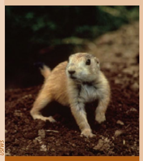
Prairie dogs belong on a prairie. It is suspected that captive prairie dogs for sale as pets led to the recent outbreak of monkeypox.

effrey Doth of International Exotic Wildlife in Houston, Texas is in trouble again. In April, Doth shipped approximately 800 small mammals of nine different species from Ghana to the United States. A number of these animals were carriers of monkeypox.