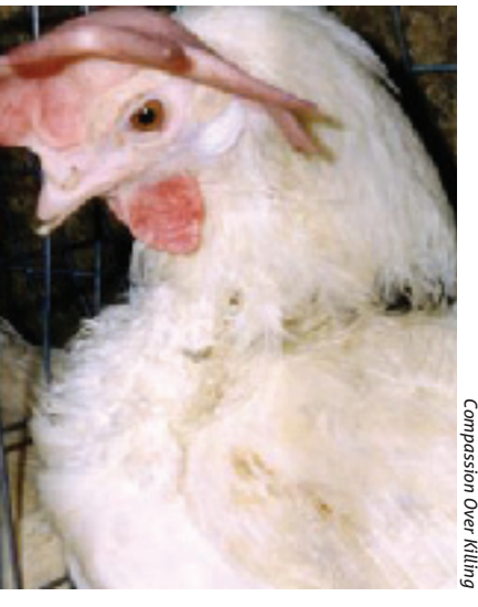
The WTO threatens a nation's ability to refuse importation of products of animal cruelty, such as banning trade in eggs from hens trapped in battery cages (see story pages 4-5).