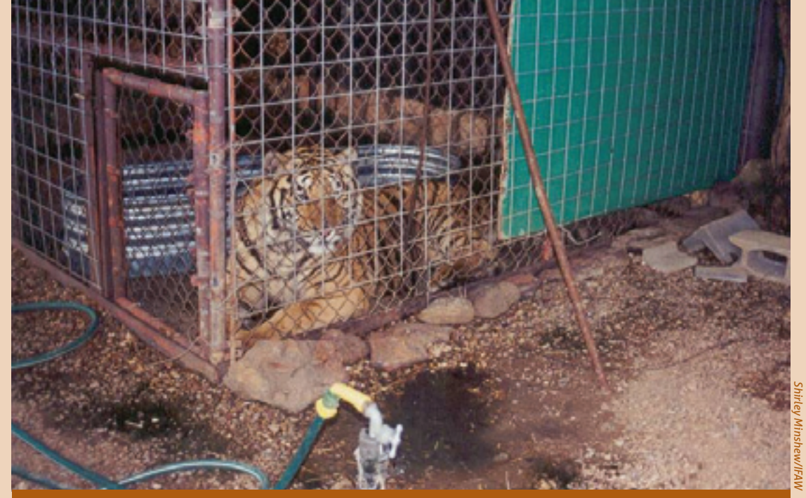
A lone tiger lies behind rusting metal fencing, amidst used tires and broken cinderblocks. This is supposedly an animal "refuge."

The latest outbreak, monkeypox, is suspected of affecting at least 72 people in six Midwest states according to the CDC (see box on page 10). It should be noted that live wildlife shipments for the pet trade are not the only risk. Mr. Jones of the USFWS observes that wild animal flesh ("bushmeat") is continually imported into the U.S. surreptitiously. One routine inspection at a refrigerated warehouse uncovered rodent bushmeat from Africa in a shipment from Ghana labeled as containing fish for human consumption.