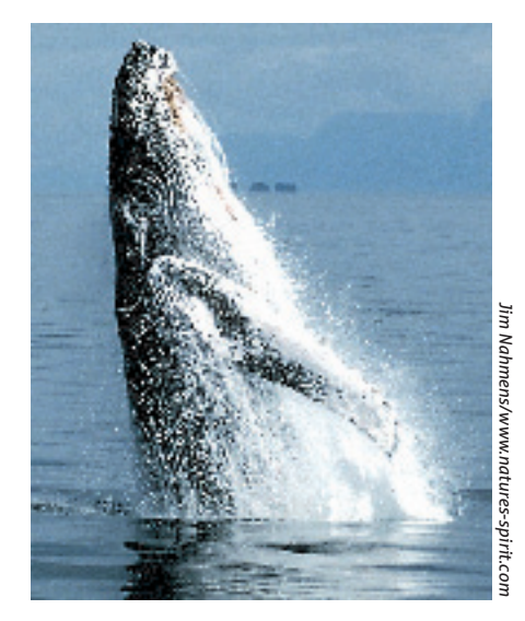
Good news! The recently-concluded IWC meeting established a Conservation Committee and rejected attempts to resume commercial whaling (see story pages 14-15).