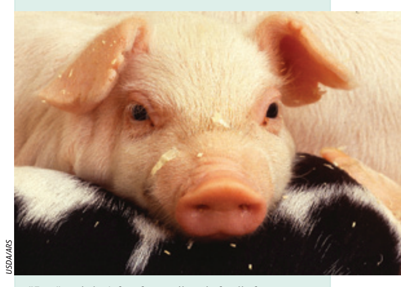
"Free" trade isn't free for small-scale family farmers. Reducing trade barriers facilitates the flow of cheap pork products from animal factories.

"Opening the Australian market for U.S. pork exports is a priority for the Bush Administration," says USTR. The U.S. won't let food safety issues interfere with our ability to flood a market with cheap hog factory pork: "Australia has sanitary/animal health barriers that keep imported pork out. USTR is pushing the Australian government to develop a new, science-based pork import policy." Rather than improve our food safety, the U.S. wants to force other nations to lower their standards. When scientific findings are not suitable to USTR, we simply challenge those findings as not being based on sound science.