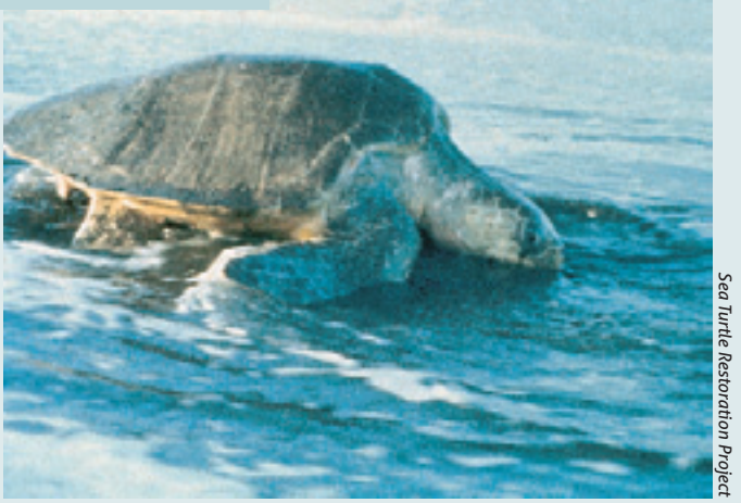
Costa Rica's Environment Minister recently asked Florida Governor Jeb Bush for help protecting green sea turtles. Passage of S. 1210 would provide funds to help all sea turtles across the globe.

Upon introduction of the legislation, Senator Jeffords noted that "marine turtles were once abundant, but now they are in serious trouble.... This legislation will help to preserve this ancient and distinctive part of the world's biological diversity."