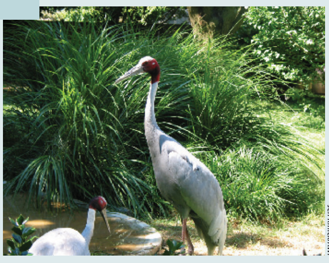
The Red-crowned crane, thought to be the third most endangered crane species, may only be found in zoos someday (like this pair) if swift action is not taken to save them in the wild.

Upon introduction of this bill (S. 128) Senator Feingold expressed his "hope that Congress will do its part to protect the existence of these birds, whose cultural significance and popular appeal can be seen worldwide." He concluded: "If we do not act now, not only will cranes face extinction, but the ecosystems that depend on their contributions will suffer. With the decline of the crane population, the wetlands