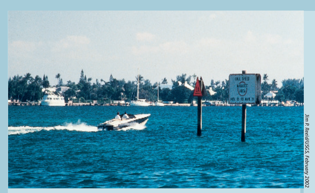
Irresponsible boaters ignoring clearly marked signs as they speed through manatee habitat.