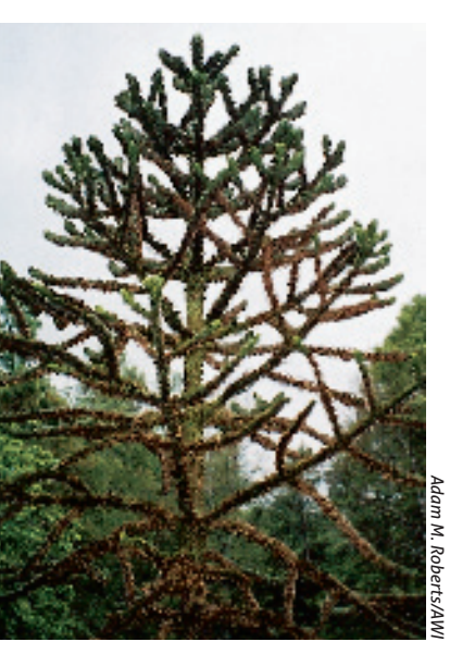
Monkey puzzle trees, now fully protected by CITES, are native to Argentina and Chile. (See story pages 4-5.)