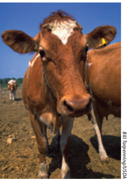
What's in a name? Your meat may be irradiated and neither truly freerange nor antibiotic free. (See stories pages 18-19.)