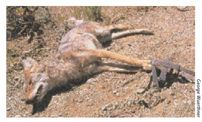
Taxpayer dollars also fund predator control methods such as the barbaric steel jaw leg-hold trap.

hen picturing the American West, one conjures romantic images of wide-open ranges filled with wild horses, cows, and cowboys. However, upon closer examination you will see corporations and the very rich exploiting millions of acres of public land to the extreme detriment of the land, people, and wildlife that inhabit it.