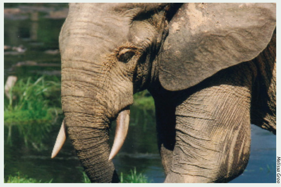
The ivory trade threatens forest elephants such as this subadult bull in Dzanga National Park, Central African Republic.

AWI was terribly disappointed in the United States delegation's impotent stand on the ivory issue. The U.S. delegation, headed by Judge Craig Manson of the U.S. Fish and Wildlife Service, tried to broker a deal to allow the sale of stockpiled ivory under certain conditions while removing the request to sell additional ivory on an annual basis. They didn't even share their amendment language with the African proponent countries before offering it on the floor! Why the U.S. would offer a compromise allowing the trade in ivory instead of standing firm in support of America's historic opposition to such a deadly trade is mystifying and unjustifiable. Our own government, despite receiving more than 10,000 emails in the few days leading up to the vote, actually voted in favor of the proposals by Namibia and South Africa to resume