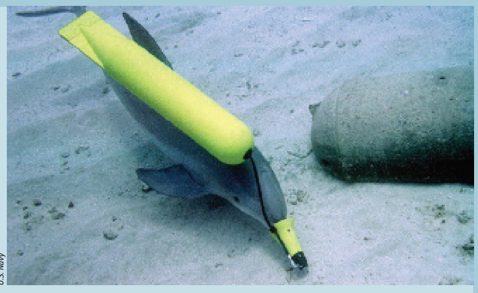
This Navy dolphin, shown with a device used for finding and marking underwater mines, may be deployed in a war against Iraq.

Turning dolphins into weapons to kill humans is unacceptable and immoral.