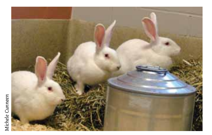
Increased cage height for rabbits is one of the improvements incorporated into the new Guide for the Care and Use of Laboratory Animals.