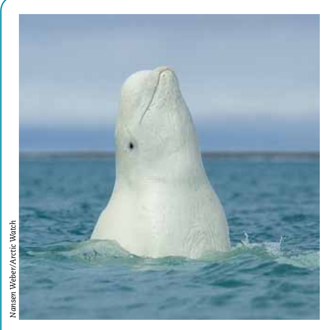
A beluga whale comes up for air and a view. In south-central Alaska's Cook Inlet, a small genetically distinct population of belugas hangs on after nearly being hunted out.