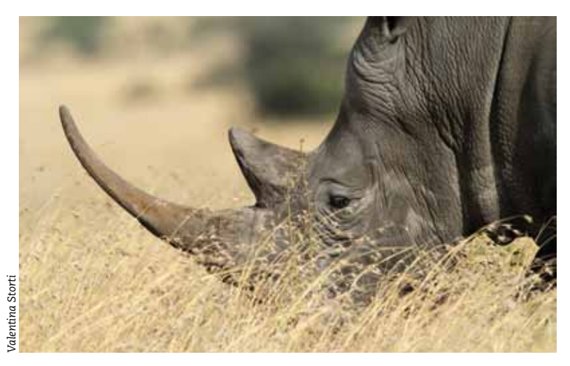
An introduced southern white rhino (Ceratotherium simum simum) in Kenya. Poachers have apparently wiped out the northern white rhino (Ceratotherium simum cottoni).

2011 WAS A GRIM YEAR FOR RHINOS. In November, the International Union for Conservation of Nature declared Africa's western black rhino officially extinct, and indicated that the northern white rhino is "possibly extinct," as well. The last Javan rhino in Vietnam was apparently felled by poachers, and fewer than 50 are estimated to remain in the wild, all in Java. Meanwhile, relentless poaching of rhinos in Africa continued, particularly in South Africa, where a record 443 rhinos were reported killed as of December 28, including 244 slaughtered in Kruger National Park alone. The slaughter took place despite renewed efforts by African governments to stem the killing by increasing the number of park rangers, police and soldiers patrolling the bush; making more arrests of suspected poachers; and handing down stiffer penalties-including jail time-for those convicted of rhino poaching or illegal possession of rhino horns.