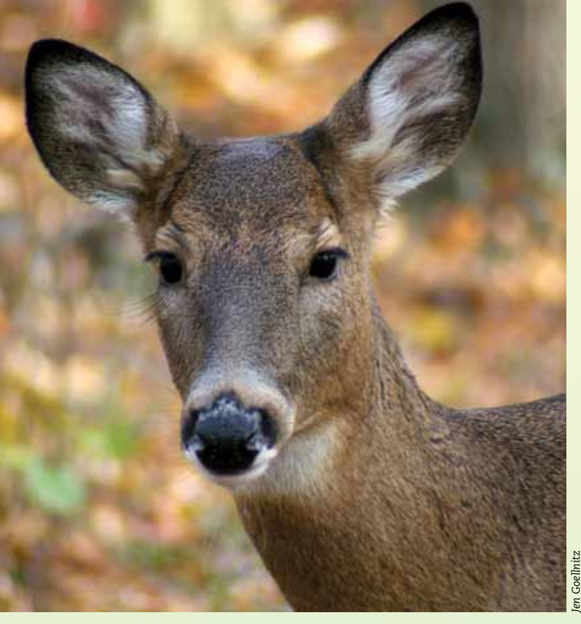
Treating does like this one with PZP can inhibit overcrowding while giving her a chance to thrive.

Ohio (1995–2003), were both terminated by state wildlife agencies concerned that the projects were becoming more about "management" and less about "research." The Fripp Island project was originally supported by the South Carolina Department of Natural Resources before it terminated the effort, and the department has reported that it may still consider the use of GonaCon ^{\text{TM}} on the island.