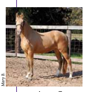
A young Tennessee Walking Horse

is supposed to protect Tennessee Walking Horses and other gaited breeds from "soring," the practice of applying chemicals or mechanical devices to horses that inflict pain in order to cause the exaggerated gait so prized by segments of the show horse industry. A 2010 report by the USDA's Office of Inspector General, however, detailed many serious shortcomings in enforcement that have allowed widespread abuse of show horses. Separately, the American Veterinary Medical Association notes on its website that USDA inspectors attended fewer than 10 percent of the events between 2008 and 2011 but still managed to document over 2,300 violations.