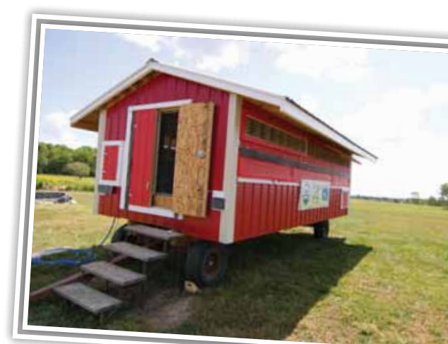
The mobile hen house, shown here, can be wheeled out to the choicest pasture areas.

I believe in the organic system and humane practices because it is the best for the consumer, the animal, the environment, the farmer and our collective future."