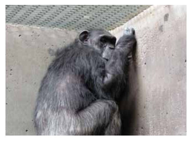
A chimpanzee named Henrietta huddles into a corner of her enclosure at a research facility.

until its suggestions can be implemented. Current research that doesn't conform to the new rules will be phased out. At present NIH funds 37 projects with chimpanzees, and Collins believes that about half of the research will fail to meet the new criteria.