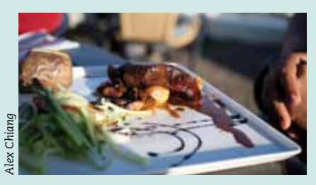
Minke whale meat dish, at a restaurant in northern Iceland

In autumn 2011, representatives of AWI and WDCS discovered meat from minke whales—who are listed on CITES Appendix I—on sale at