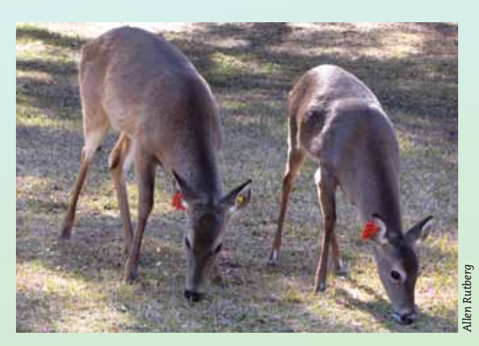
Healthy deer following a successful immunocontraception trial involving PZP on Fripp Island, SC.

In the fall of 2010, however, the NPS suddenly terminated the immunocontraception program on Fire Island, Eventually, FIIS Superintendent K. Chris Stoller claimed that halting the use of immunocontraception was necessary to transition from a "research project" to a white-tailed deer "management plan." Developing this plan will entail consideration of other alternatives, presumably including lethal control, to manage the island's white-tailed deer—a population that had been successfully controlled using immunocontraception for nearly two decades. Indeed, by terminating this project, the NPS appears to be undermining the benefits achieved through immunocontraception research, in that the deer population will be allowed to resume unchecked growth while the management plan is developed. Why did the NPS not allow the immunocontraception project to continue at FIIS while