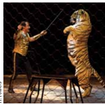
A tiger forced to perform banal "tricks" at a Ringling Bros. show.

Ringling Bros. and Barnum & Bailey —the "Greatest Show on Earth" according to its slogan—has a new distinction that probably won't appear in its promotional materials: The circus company has been slapped with the largest fine ever under the Animal Welfare Act (AWA) against an exhibitor.