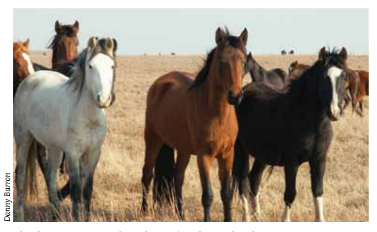
Thanks to Congress, a brutal American horse slaughter industry may resume—with taxpayer dollars funding the necessary USDA inspections.

FOR THE FIRST TIME IN SIX YEARS, Congress has opened the doors to restarting horse slaughter in the U.S. The bill to fund the U.S. Department of Agriculture for the rest of FY 2012 was stripped of language prohibiting USDA inspections of plants that slaughter horses for human consumption. As a result, in this time of runaway deficits and cutbacks in essential programs, and against overwhelming objections from the public, Congress has given the USDA the green light to resurrect an expensive and unnecessary program if foreign interests again decide to start killing American horses on American soil to satisfy foreign appetites. This development underscores the urgency of passing the American Horse Slaughter Prevention Act (H.R. 2966/S. 1176).