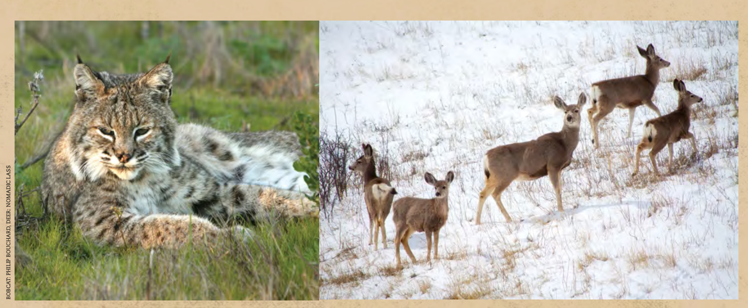
Left: An off-duty bobcat in California conserves energy before the next hunt. Right: Absent predators, ungulates like these mule deer in Montana can quickly proliferate and overbrowse sensitive vegetation.

The dingo is the sole remaining apex predator in Australia. The species is extensively controlled to reduce impact on livestock. Indeed, a 5,500 kilometer dingoproof fence has been constructed to keep dingoes out of Australia's most prominent sheep-producing regions. As reported by Ripple et al., where dingoes exist, they effectively suppress introduced herbivores and red fox