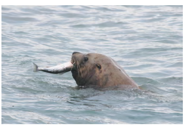
A sea lion catches a meal off the coast of Alaska. Competition for food in heavily fished areas sometimes pit these animals against commercial fishermen.

The third IMCC was held August 12–19 in Glasgow, Scotland. The main theme, "Making Marine Science Matter," was addressed in a number of contexts, including marine noise, overfishing, marine protected areas, and marine tourism. Also, for the first time, the IMCC hosted a symposium on the ethics and welfare of marine mammals involved in research, recreation, education, and human-