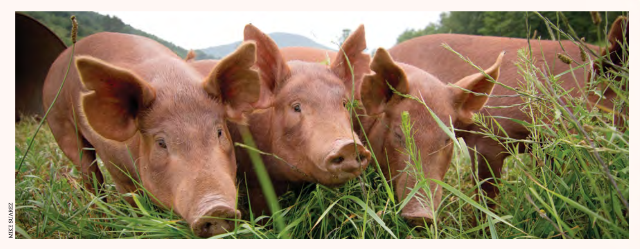
A recent study that examined empathy in pigs found that the distress of one pig will upset her neighbors.

2014), scientists adapted a paradigm from human infant studies to examine jealousy in companion dogs. They had people lavish attention on objects, one of which was a realistic-looking stuffed dog that barked and whined, in front of their companion dogs. The interactions and the dog responses were recorded and analyzed. Nearly all of the dogs pushed at either the stuffed dog or the owner and almost one-third attempted to get between the object and their owner. Significantly, they did not exhibit these behaviors to the same degree when the object of affection was not dog-like. The authors say the results lend credence to the notion that dogs, like humans, do experience jealousy.