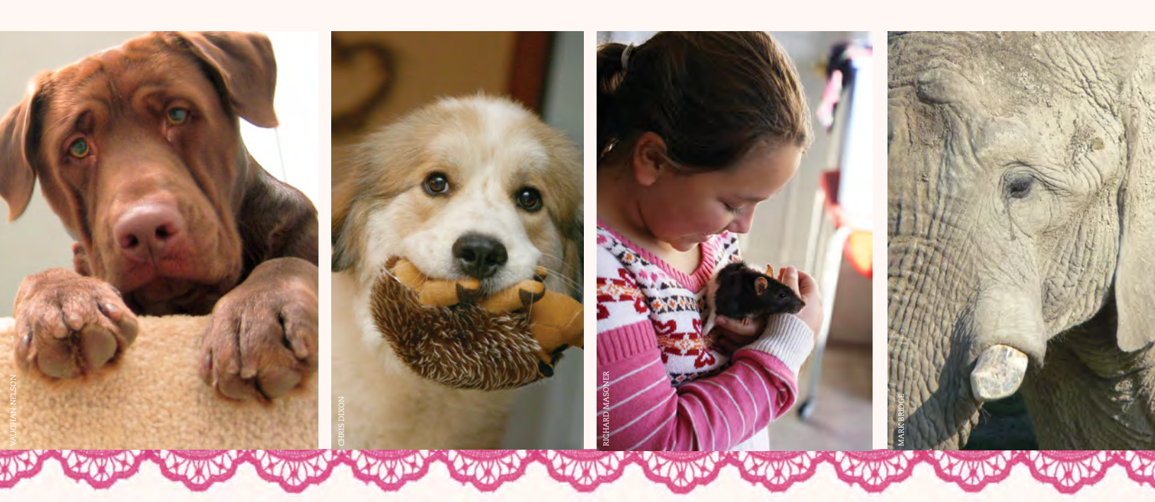
Increasingly, science is providing evidence for what many who dwell among animals have long accepted: complex emotions are not the exclusive domain of Homo sapiens.