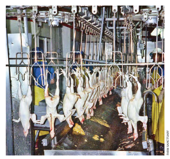
A proposal to allow poultry slaughterhouses to speed up the slaughter processing—increasing the likelihood of suffering for the birds—was shelved after protests by AWI and others.

As a result of the outcry, USDA changed course; its final regulations, published in August, lack the anticipated increase in slaughter line speed and also make participation in the new poultry inspection system voluntary as opposed to mandatory, as originally proposed. While the final regulations still allow participating companies to sort their own carcasses for defects, USDA