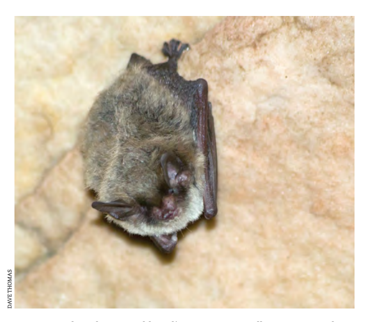
A northern long-eared bat clings to a cave wall. USFWS caved to industry groups in putting off a decision on whether to list this species as endangered.