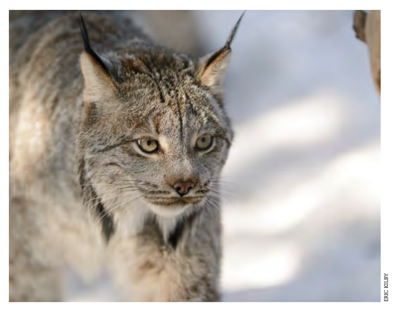
USFWS expanded endangered species protection to the contiguous United States for Canada lynx, but shortchanged the stealthy, seldom-seen cats on critical habitat.

Unfortunately, the Service still scrimped on critical habitat, once again declining to include important areas in the Southern Rockies, parts of New England, and elsewhere. Despite the new coast-to-coast DPS, providing a prohibition on intentional hunting and trapping takes, lynx are still subject to "incidental" trapping takes. Furthermore, outside critical habitats, there will be less stringent reviews of human activities that could damage the dense forests lynx depend on. 🏖