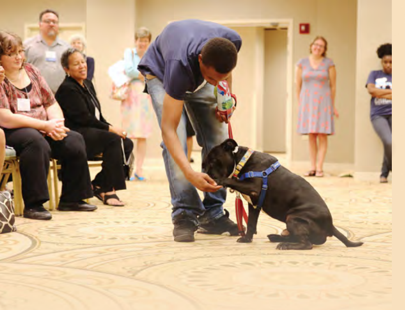
Through Safe Haven Chicago's Lifetime Bonds program, at-risk youth train, socialize, and care for canines in need of a helping hand.

judge remarked that he did not really know what factors to consider when deciding to place a child in a foster home if there was a dog in the family; an interesting discussion ensued. After the conference, AWI contacted other partners in the legal profession to inquire about developing guidelines for judges making these decisions.