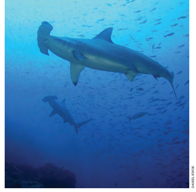
The scalloped hammerhead is one of the many shark species that have seen their populations plummet as a result of a relentless assault by those coveting their fins.

AWI continues to push for shark conservation among government agencies and state legislatures, build consumer awareness, and encourage restaurants, other companies, and airlines to stop serving, offering for sale, or transporting shark fins. For more information and to find out what you can do to help, see www.awionline.org/sharkfinning.