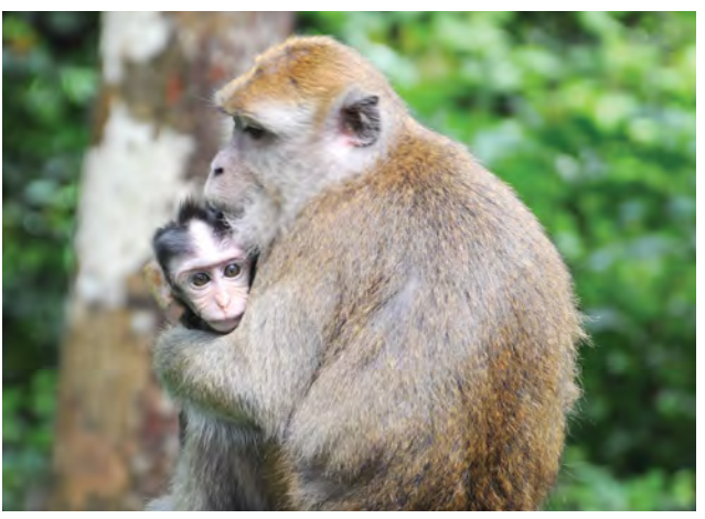
Bonded: a mother macaque wraps her baby in a tight embrace. A University of Wisconsin study will strip newborn macaques from their mothers, subject them to isolation and fearful stimuli, then sacrifice them to gauge the effects on the brain.

There has been significant uproar about this study and the University of Wisconsin is clearly feeling pressure