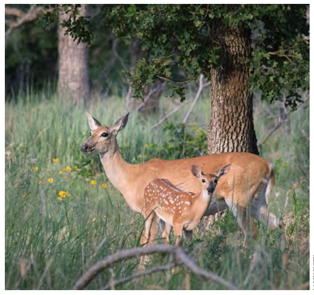
Expanding deer populations often lead to human-wildlife conflicts and government-sponsored deer culls. Fertility control represents a non-lethal, cost-conscious way for communities to keep deer populations in check.

AWI also continues to support fertility control techniques such as immunocontraceptive vaccines (see Fall 2011 AWI Quarterly). After AWI outreach earlier this year to communities on Long Island, New York, the Village of East