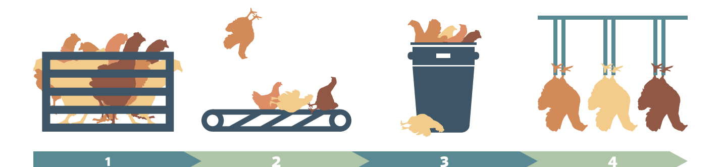
Figure 1. How Most Poultry Is Killed in the US