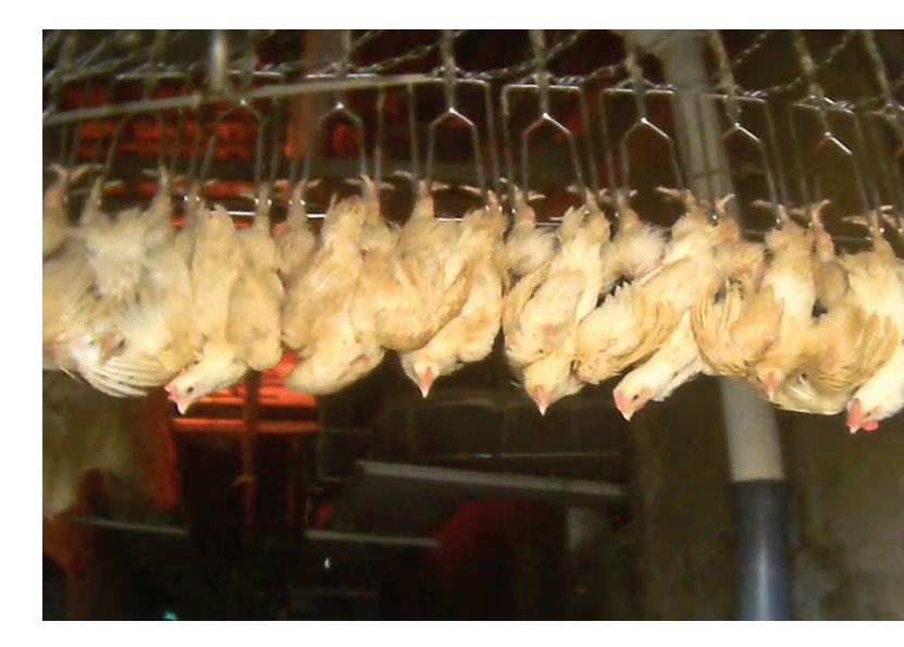
In the United States,, birds are still conscious when they are shackled by their legs and hung upside down.

The fourth rulemaking petition was submitted by Mercy For Animals in November 2017. It requested that the USDA include birds slaughtered for food under the HMSA and FMIA—arguing that the department has the authority to cover birds and refusing to do so is arbitrary and capricious. In March 2018, the USDA denied the petition, stating, "The HMSA does not include poultry as 'livestock' for the purposes of the Act." Mercy For Animals has not challenged the denial.