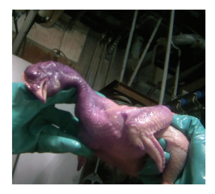
The bodies of birds who drown in the scald tank turn bright red.