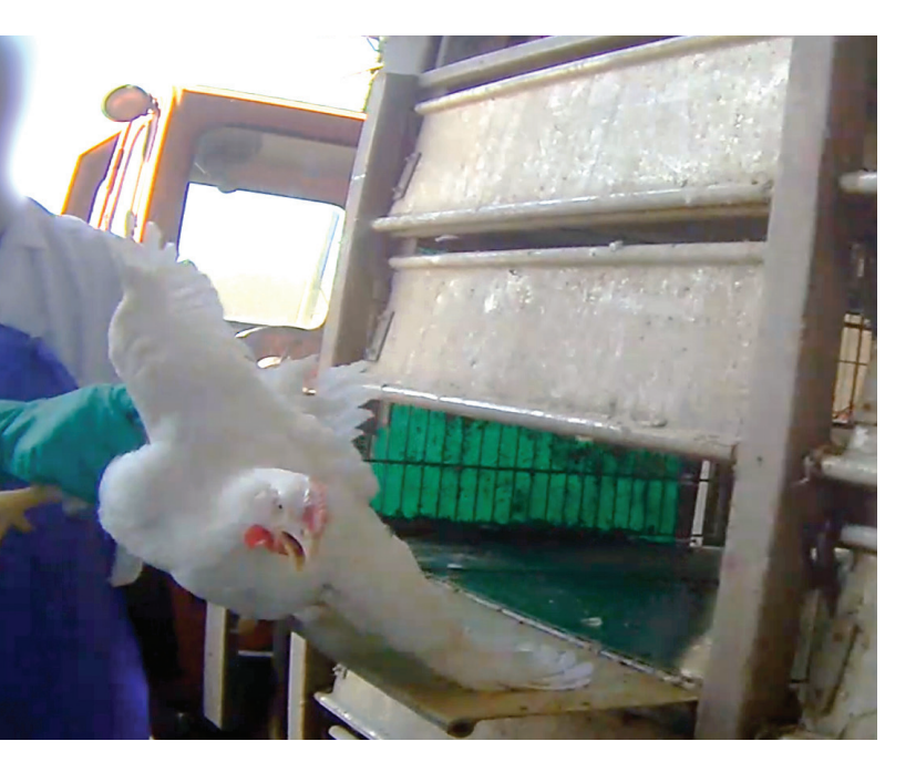
Rough handling can result in birds becoming injured before slaughter.

Video captured during the investigations suggests that abuse of birds is common practice, at least at some slaughter establishments, and the GCP records capture only a small portion of inhumane handling events that take place at poultry slaughter plants. Moreover, the number and gravity of the GCP records of investigated plants were a poor indicator of the extent to which the behavior captured during the investigations took place.