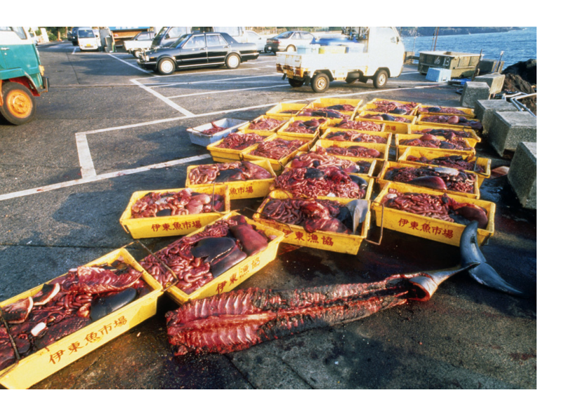
Body parts of small cetaceans, Japan

Dall's porpoise (Phocoenoides dalli, dalli- and truei-types), short-finned pilot whale (Globicephala macrorhynchus, northern and southern forms), Risso's dolphin (Grampus griseus), Pacific whitesided dolphin (Lagenorhynchus obliquidens), false killer whale (Pseudorca crassidens), pantropical spotted dolphin (Stenella attenuata), striped dolphin (Stenella coeruleoalba), common bottlenose dolphin (Tursiops truncatus), Baird's beaked whale (Berardius bairdii), rough-toothed dolphin (Steno bredanensis), melon-headed whale (Peponocephala electra), Hubbs' beaked whale (Mesoplodon carlhubbsi), ginkgo-toothed beaked whale (Mesoplodon ginkodens), Indo-Pacific bottlenose dolphin (Tursiops aduncus), pygmy sperm whale (Kogia breviceps), dwarf sperm whale (Kogia sima), Northern right whale dolphin (Lissodelphis borealis), orca (Orcinus orca) Numbers killed: less than 3,000 a year; after a constant decline from 46,000 in 1993 Type of hunt: directed hunts (acoustic drive hunts, harpoons, spears, knives)