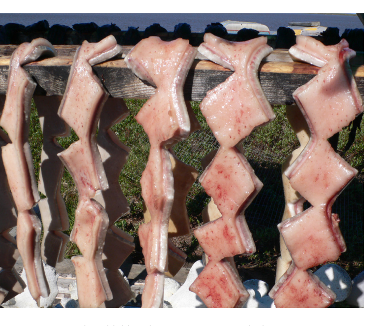
Beluga blubber drying at Point Lay, Alaska

(e.g., 2007, when the number of animals killed peaked at 270), annual kill rates have been up to 3.6 times the recommended level (Environmental Investigation Agency 2014, Allen & Angliss 2010). In the EBS, the number of whales killed in subsistence hunts has risen since the 1990s from an average of 130 during 1994–1998 to 193 during 2005–2009 (Environmental Investigation Agency 2014). The US Marine Mammal Commission (MMC) has raised concerns over the recent failure of the US to include struck and lost data for subsistence hunts in Alaska (MMC 2018).