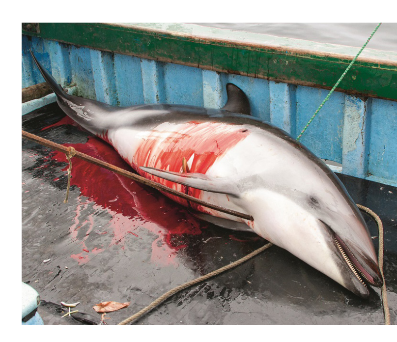
Harpooned dusky dolphin, to be used as bait in Peruvian fisheries