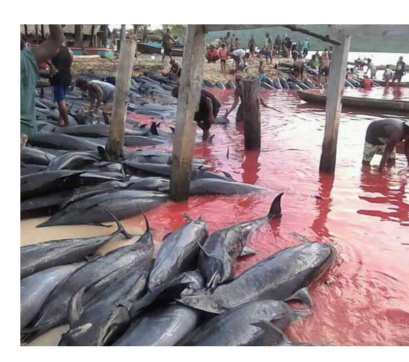
Dolphin hunt, Solomon Islands

The value of dolphin teeth increased from US$0.14/ tooth in 2004 to $0.70/tooth in 2013, providing villagers more incentive to hunt (Oremus et al. 2015). In 2013, the IWC Scientific Committee expressed concern regarding the potential depletion of local populations, given the scale of the recent (and historical) catches (IWC SC 2013, p. 67). Furthermore, DNA analysis has revealed the limited connectivity of local bottlenose dolphin populations and, consequently, a low likelihood for repopulation after offtakes if a local population is extirpated (Oremus & Garrigue 2015).