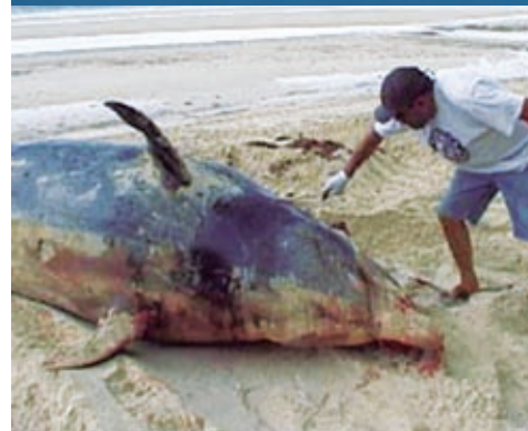
This Cuvier's beaked whale (Ziphius cavirostris) was a victim of the 2000 Bahamas stranding event, in which 17 individuals from several whale species stranded after naval exercises involving the use of active sonar.