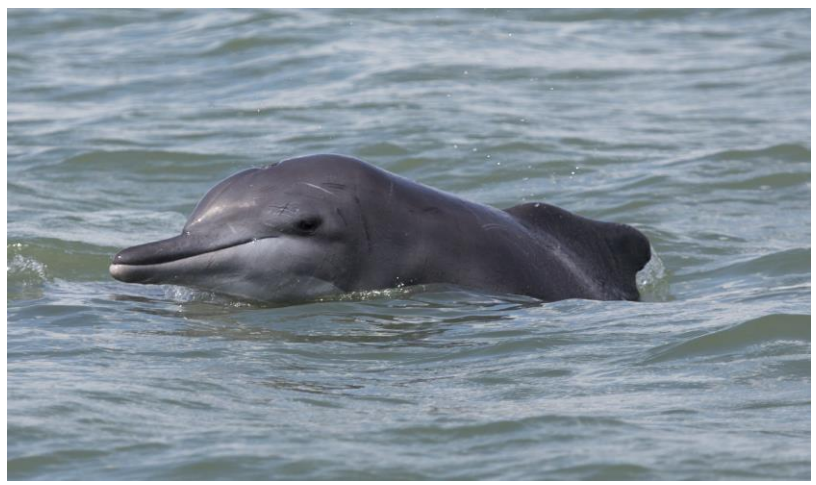
Atlantic humpback dolphin surfacing in nearshore waters of the Rio Nuñez Estuary, Guinea.