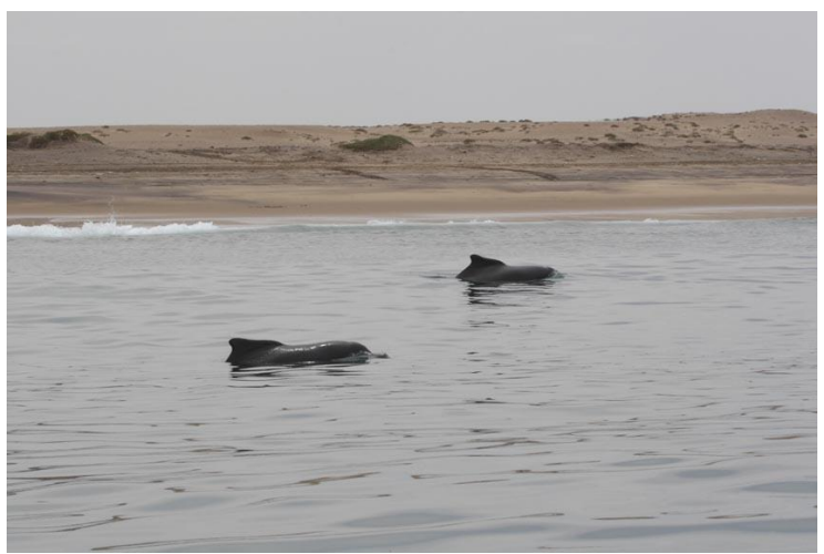
Fig. 3. Two Atlantic humpback dolphins move along shore near the coastline of Angola.

627; Van Waerebeek et al. 2004, p. 73; Weir and Collins 2015, p. 103). Despite some previous speculation, this is not a freshwater species.