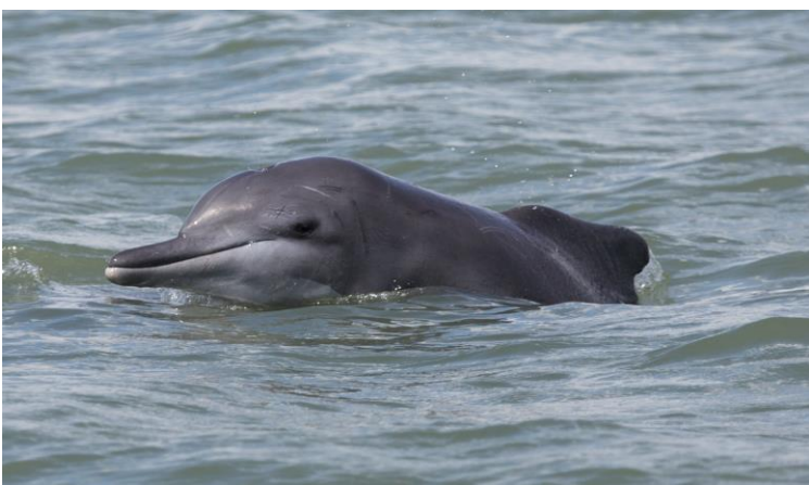
Fig. 4. An Atlantic humpback dolphin surfaces in the Rio Nuñez Estuary, Guinea, showing the characteristic hump of the species, on which the small rounded dorsal fin sits.

The only population estimate based on quantitative methods is for the Angola stock, which inhabits the Flamingoes area. This stock has been studied with photoidentification methods and is thought to contain only 10 individuals (Weir 2009, p. 327). Collins (2015, p. 53) and Collins et al. (2017, Population) reviewed all available data on the population biology of this species and concluded that the total global population of the species is almost certainly less than 3,000 individuals. Assuming about 50% mature individuals, this would make the mature population about 1,500 individuals (Collins et al. 2017, Assessment Information). Although this is speculative, it is based on a thorough review of the best available data and new research from the past few years has not provided evidence to undermine this assumption.