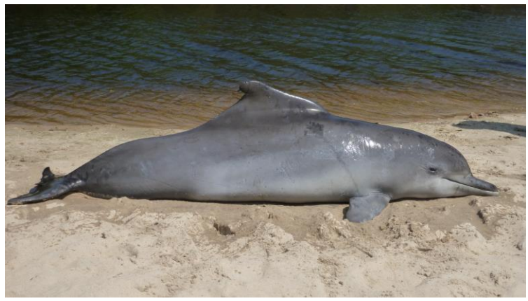
Fig. 1. A young specimen of the Atlantic humpback dolphin, which was caught in a gillnet.

The Atlantic humpback dolphin, Sousa teuszii , is one of four known species of humpback dolphins in the genus Sousa (Mendez et al. 2013, p. 5936; Jefferson and Rosenbaum 2014, p. 1494). This species is the only humpback dolphin found in the Atlantic Ocean and occurs along the coast of western Africa. Sousa teuszii was first described in the late nineteenth century by Kükenthal (1892, p. 442), who based his description primarily on perceived differences in the skull of the holotype (collected in Cameroon), from other humpback dolphins known at the time. The distinctness of the species from the others has been questioned over the years (see Ross et al. 1996, p. 1), but recent work involving adequate samples of both morphometric (Jefferson and Van Waerebeek 2004, p. 3) and molecular (Mendez et al. 2013, p. 5936) characters has confirmed that it is a species separate from the other three of the genus Sousa: S. plumbea (Indian Ocean humpback dolphin), S. chinensis (Indo-Pacific humpback dolphin), and S. sahulensis (Australian humpback dolphin) (Jefferson and Rosenbaum 2014, p. 1494).