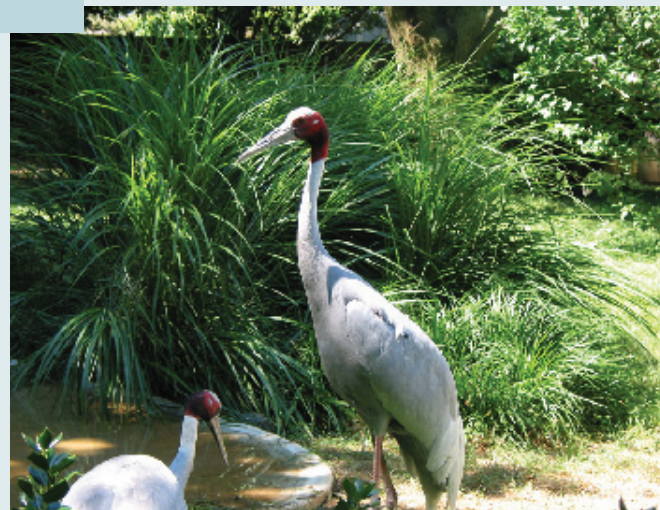
The Red-crowned crane, thought to be the third most endangered crane species, may only be found in zoos someday (like this pair) if swift action is not taken to save them in the wild.

Upon introduction of this bill (S. 128) Senator Feingold expressed his "hope that Congress will do its part to protect the existence of these birds, whose cultural significance and popular appeal can be seen worldwide." He concluded: "If we do not act now, not only will cranes face extinction, but the ecosystems that depend on their contributions will suffer. With the decline of the crane population, the wetlands