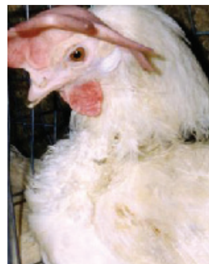
Compassion Over Killing

The WTO threatens a nation's ability to refuse importation of products of animal cruelty, such as banning trade in eggs from hens trapped in battery cages (see story pages 4-5).