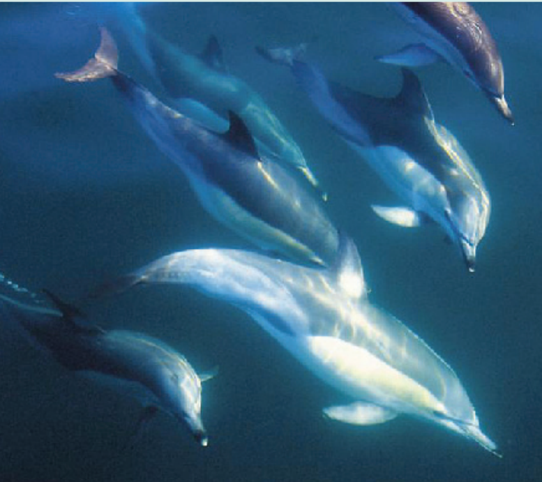
New Zealand International Exclusive Tours

The WTO pushed Congress to weaken America's democratically-enacted law barring the import of dolphin-deadly tuna.