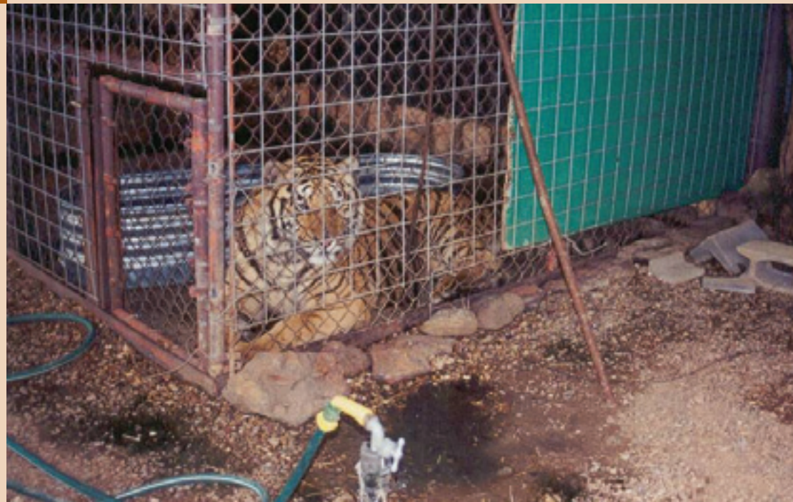
A lone tiger lies behind rusting metal fencing, amidst used tires and broken cinderblocks. This is supposedly an animal “refuge.”

The latest outbreak, monkeypox, is suspected of affecting at least 72 people in six Midwest states according to the CDC (see box on page 10). It should be noted that live wildlife shipments for the pet trade are not the only risk. Mr. Jones of the USFWS observes that wild animal flesh (“bushmeat”) is continually imported into the U.S. surreptitiously. One routine inspection at a refrigerated warehouse uncovered rodent bushmeat from Africa in a shipment from Ghana labeled as containing fish for human consumption.