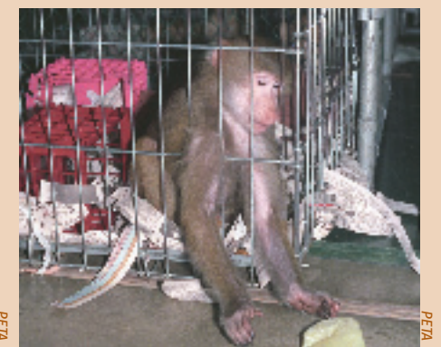
A lion languishes in a cage on concrete floors with wire fencing and no psychological stimulation or companionship (left); A caged bear, living in solitude, stares out from his barren cage in someone’s backyard (middle); This lone baboon in a traveling animal show lives amidst little more than plastic crates and shredded newspaper (right).