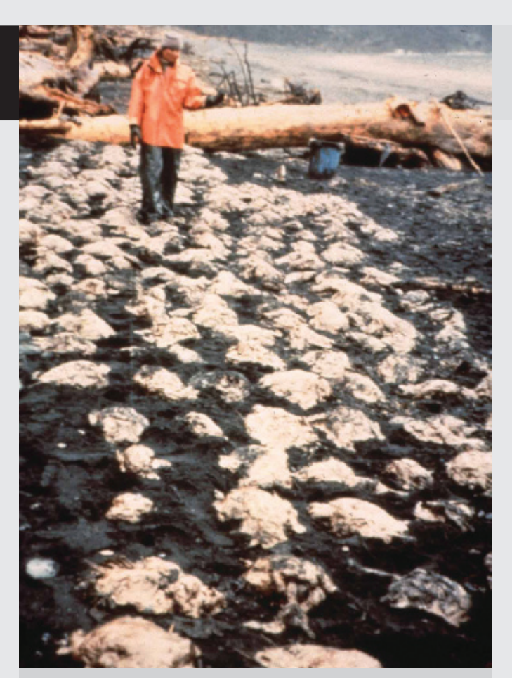
The Exxon Valdez oil spill occurred during the annual spring migration of waterfowl to Prince William Sound. Hundreds of thousands of seabirds, including these murres, died from oil coating.

These attacks are possible for three reasons. First, Exxon is so powerful economically that a substantial proportion of the active participants in the small field of oil pollution research find that it pays well to advance company policy. These consultants are often asked to peer-review contributions to scientific journals, and the anonymity of the process provides an open door for abuses. Economic clout may also be an effective tool for manipulating the agendas of scientific meetings (e.g. by ensuring that Exxon-supported scientists always speak after government scientists to facilitate rebuttal). Second, while unethical, it is not illegal to publish knowingly false information in a scientific journal, provided the funding source is private. Numerous safeguards are in place to prevent publicly-supported scientists from lying in print, but these simply do not apply to their privately-funded counterparts. Third, unlike government scientists, the data and records of privately-funded scientists may be kept secret, so their research contributions may escape the scrutiny necessary to expose scientific fraud.