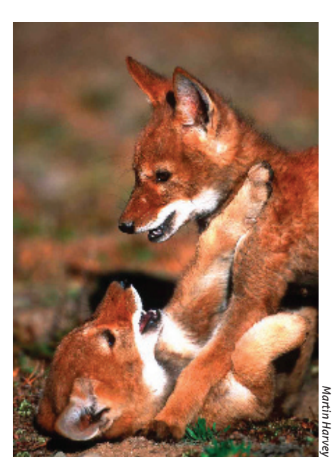
Playful Ethiopian wolf cubs are oblivious to the perils facing their species—including a dangerous rabies outbreak (see story, page 12).