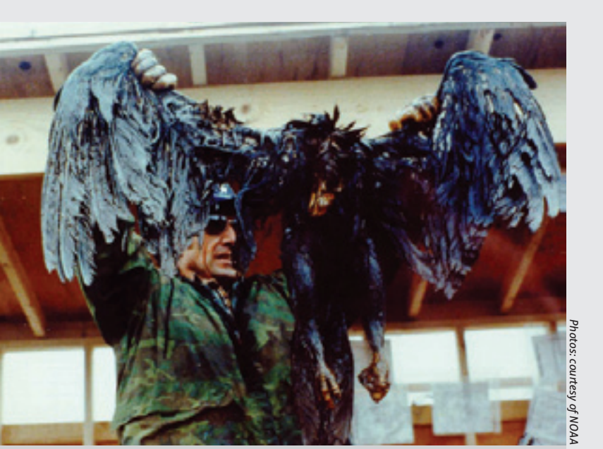
Still threatened in most of the US, bald eagles thrive in Alaska. Hundreds died in Prince William Sound following the Exxon Valdez oil spill.