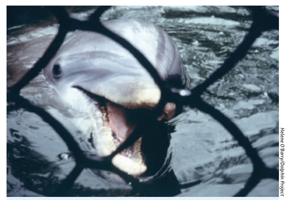
A captive dolphin's world view until he dies.

But not all of the news is so rosy. Whereas watching cetaceans perform in captivity seems to be losing its cachet, swim-with-the-dolphins and dolphin-assisted therapy programs are taking off like rockets, especially in the Caribbean and Asia. With many facilities boasting of a long waiting list of tourists eager to pay $100 an