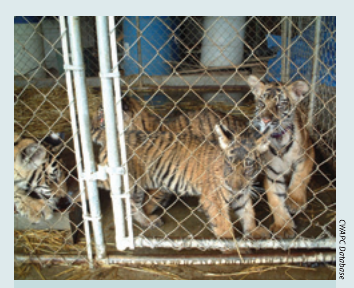
Young tigers belong in their wild jungle homes, not in backyard cages. No one should keep these exotic, potentially dangerous animals as pets.

"Finally, it allows the Department to exempt itself from