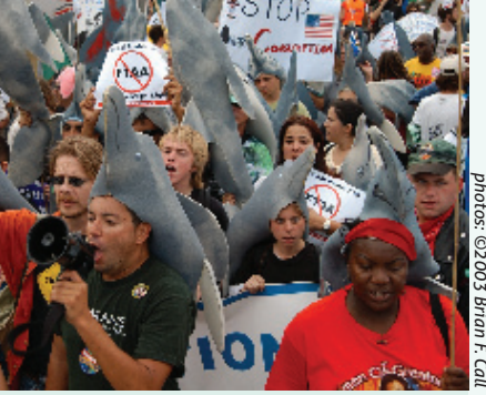
Marchers wear dolphin hats as they walk during an FTAA demonstration.