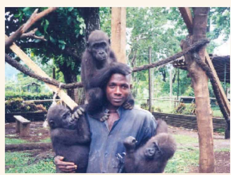
Left: One of the four gorillas smuggled from Nigeria to Malaysia in January 2002: her fate still hangs in the balance, will it be a zoo in South Africa or a sanctuary in Cameroon?

Minister Okopido also announced that he was going to ask President