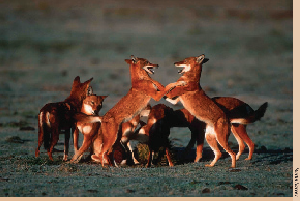
Ethiopian wolves live in large, social family packs at altitudes as high as three to four thousand meters.