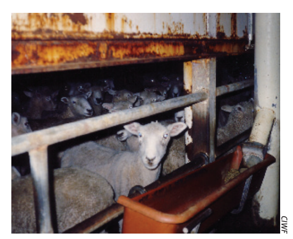
Australia ships millions of sheep each year. Subject to extreme temperatures with limited food and water, all suffer and thousands die during transport (see story, page 7).