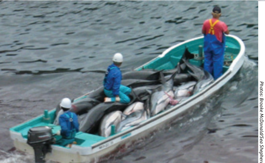
\label{lem:continuous} A\ boatload\ of\ toxic\ Taiji\ dolphins\ en\ route\ to\ the\ fish\ market.

meat to the fish market and live "specimens" to public display facilities. To those standing vigil and millions worldwide, the ongoing massacre is an absolute horror—the biggest single intentional destruction of whales and dolphins in the world.