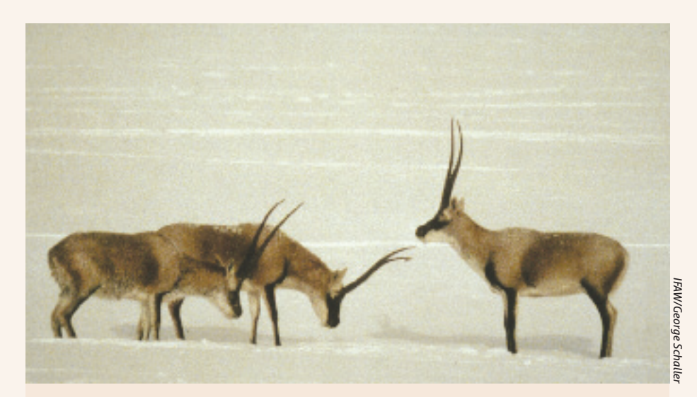
Tibetan Antelope, clinging to life on the remote Tibetan Plateau, are killed for their fur, which is used to create some of the most valuable shawls on earth.

A listing under the ESA would greatly assist wildlife law enforcement agents in the US. Although CITES prevents the importation of shahtoosh into the country, in order to prosecute someone trying to sell the products in America, one must prove that it was illegally smuggled—a difficult burden. Listing under the ESA would prohibit the domestic sale completely. We hope for a final decision to list soon.