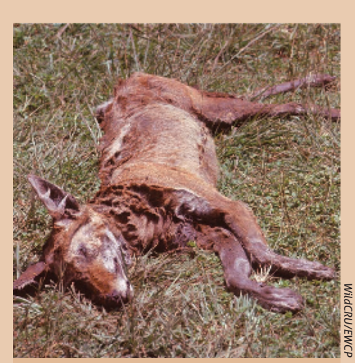
Sadly, once a wolf contracts rabies, the only relief from the debilitating disease is death.

The Ethiopian wolf has become a symbol of the unique wildlife of the country. 2004 promises to be a pivotal year in the survival of the species.