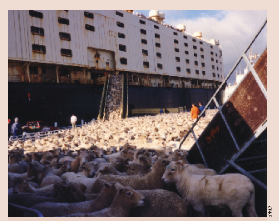
This trading of live animals is inhumane and must end. At the very least, journey length should be limited and contingency plans instituted.