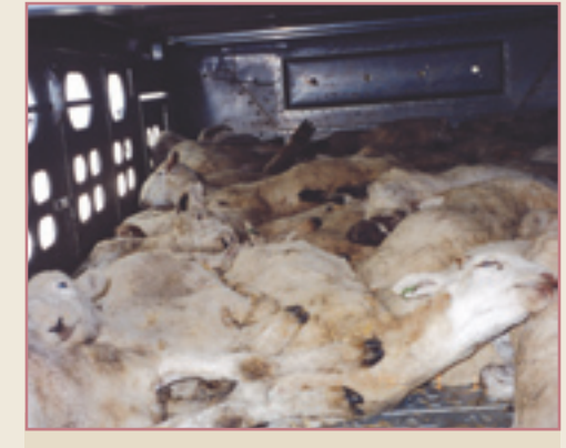
Often farm animals are transported in vehicles lacking temperature controls, resulting in heat-induced stress, hypothermia and death.

The Animal Welfare Institute advocates the transport of meat rather than live animals, and encourages consumers to buy locally raised and processed animal products. Each time an animal is transported, there is the potential for pain and fear. Think about that on your next trip. &