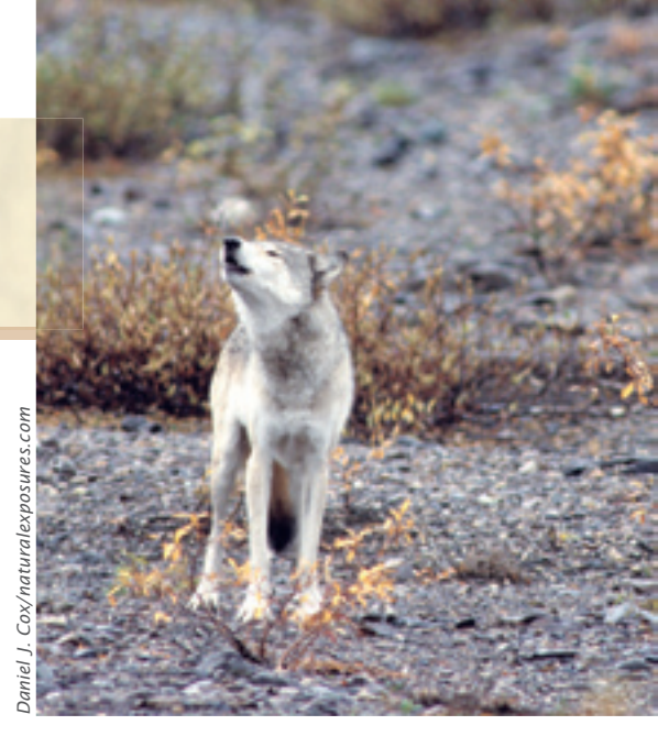
The well-known Toklat wolves need updated protections from hunters and trappers.

ranging park wolves from hunters and trappers. However, the Alaska Board of Game has refused to expand the buffer zone, maintaining that wolves in Alaska are managed for population, not for their safety and livelihood.