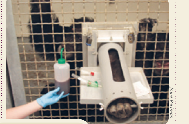
Another chimpanzee prepares for a conscious blood sample.