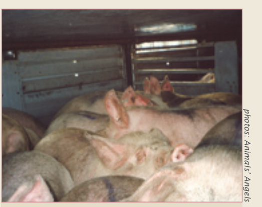
During transport, farm animals are typically overcrowded and forced to stand without bedding, food or water for over 24 hours.

This action is a follow-up to the historic Global Conference on Animal Welfare, held in Paris in Feb. 2004 (AWI Quarterly, Spring 2004). The OIE will next establish production standards for farm animals.