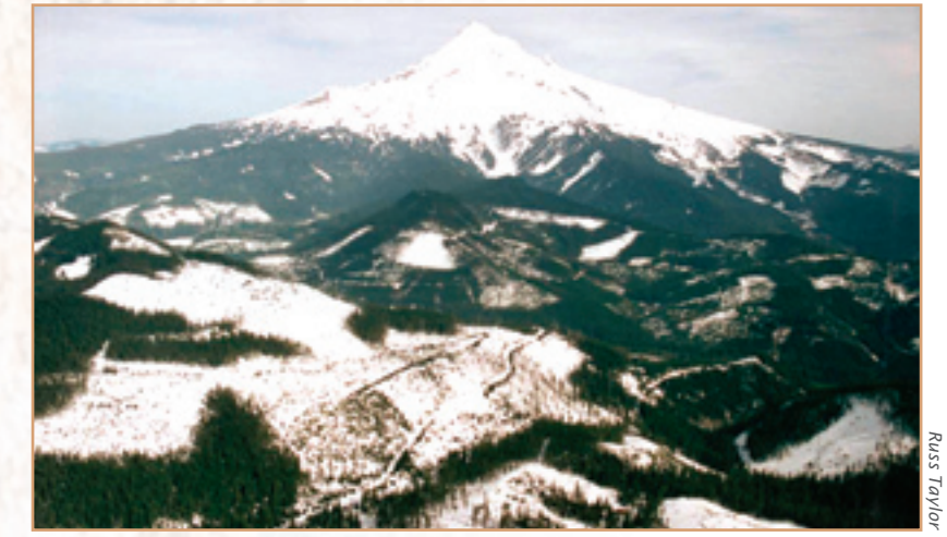
This Oregon landscape in Mt. Hood National Forest lost nearly 85 percent of its trees because of weak protection for America's forests.

For the people, fish, wildlife and all other life forms depending on nature, it's a sad time. It is also a sad time because of the plague of morally and spiritually impoverished behavior inside the Beltway, such as politically compromised defenders of nature who have cynically decided the best way to protect nature is to focus on getting Democrats elected no matter how weak or timid they may be. If you looked behind the green curtain of all too many environmental campaigns, you would find the political players from big funders and compromising environmental groups and political lapdogs who are aiding and abetting by allowing extractive industries to continue to pillage, desecrate and