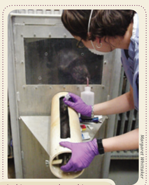
A chimpanzee places his arm in a blood sleeve in preparation for a conscious blood sample.

Fecal samples will soon show if the working theory is correct: that the stress levels of our pigeons are indeed lower in the flight cage environment. These samples are in the process of being assayed, and we await the results with great expectations. In the meantime, however, we are proud to note that the pigeons' former stereotypic behaviors seem to have disappeared, likely due to their engagement in species-specific activities and the companionship of others.