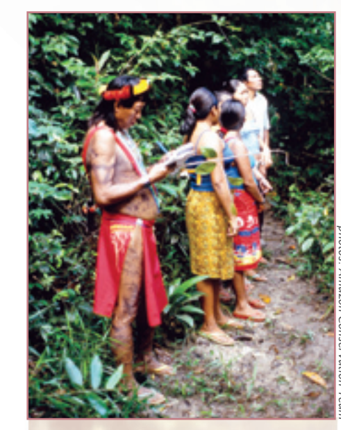
A Shaman meets with apprentices in Kwamalasamutu, Suriname.

ACT has helped map over 30 million acres of rainforest; currently its members and partner tribes are plotting land in Brazil, Suriname and Colombia using GPS technology. Western-trained cartographers are working with the Indians to compose