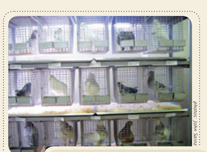
Research pigeons in the Psychology Department vivarium live in small, single-bird cages.

cages. These pathological behavior patterns are incessant and disturbing, but in my opinion, they also reflect a serious emotional imbalance in the individual animal. Other pigeons became listless-they ate and drank, but seemed disconnected. They appeared to have lost the edge their counterparts had in the wild.