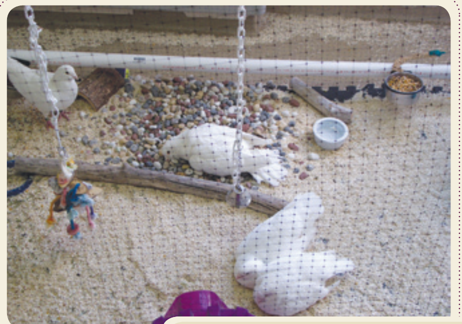
These pigeons now live together as a group in the large, enriched flight cage.

cal sampling procedures can make research with chimpanzees better. Training techniques, especially those focusing on positive reinforcement procedures, provide captive primates with some control over what happens to them—a part of their natural existence typically difficult to provide in captivity. Our project aimed to determine whether voluntary participation in blood collection procedures affected physiological values in the blood of chimpanzees. Preliminary analyses of older data indicated the technique used to collect blood from the animals affected a number of physiological values. We found the values obtained when subjects