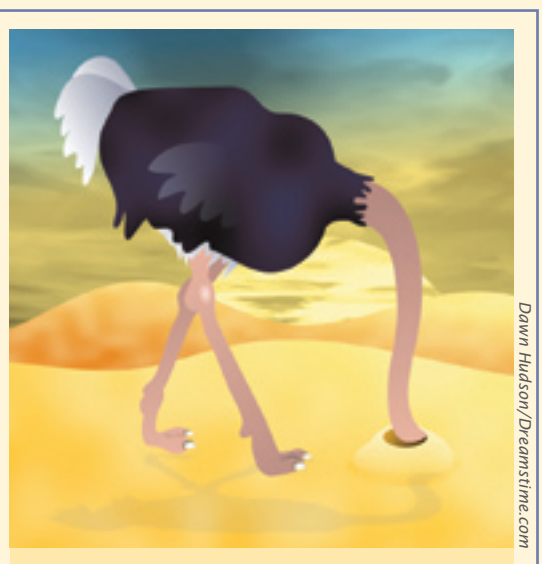
An ostrich is "one who tries to avoid disagreeable situations by refusing to face them," according to one definition in the American Heritage Dictionary. Note: ostriches don't really bury their heads in the sand.

way, the Republican-controlled House of Representatives overwhelmingly voted in favor of recently. The AVMA, on the other hand, continues to oppose this humane legislation. However, the impetus behind the Association's refusal to allow AWI to exhibit at this year's convention is undoubtedly based on our exhibit at the 2004 convention, which was described by an AVMA representative as "very contentious."