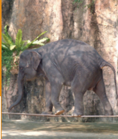
Too Close For Comfort

October 9, 2004. The tiger was about ten feet away. Sure, he was in a zoo enclosure, behind an iron gate, but this wild animal, capable of killing a man, was still only 10 feet away. Strangely, the padlock on the door was open. I opened the door and entered a small utility room, filled with mops and buckets. A smaller gate led into the tiger enclosure. There was the tiger, on the other side of the gate, 10 feet away. But that small gate was also unlocked. With curiosity, I opened the gate, and the tiger arose and slowly crept in my direction. I quickly closed the gate and backed out of the room. What if the tiger got through the gate before I closed it? What if it was not me at that open gate? What if it was a lost 8-yearold child?