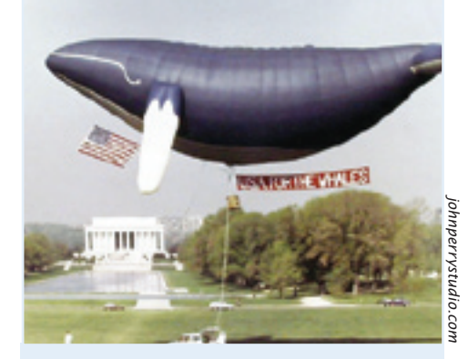
The icon of the Save the Whales campaign, Flo the inflatable whale, was a regular Washington, DC visitor in the 1970s.

Whales are still endangered and have not yet recovered to historic, pre-exploitation levels. Additionally, there is growing evidence that other human-caused impacts, including ship-strikes, noise and toxic pollution, are affecting whale populations. Whale meat has become increasingly dangerous to eat because of the bioaccumulation of toxic substances, and several whaling nations have issued health warnings for its consumption. Coincidently, demand for the meat has declined, as evidenced recently when Japan reintroduced it into hundreds of school lunch programs in Wakayama Province. Finally, the multi-million dollar whale-watching industry is proving far more lucrative than whale killing, and it is rapidly growing. Sadly, intransigence is keeping whaling alive in the majority of whaling nations, and the IWC is allowing it to thrive.