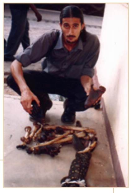
The author shows severed Chimpanzee hands, confiscated from bushmeat dealers.

The organization is effective because we undertake investigations,