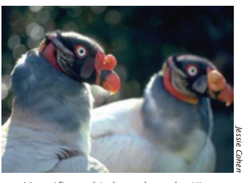
Magnificent birds such at the King Vulture, pictured above, as well as 93 other non-native migrating species, are victims of antianimal measures slipped through Congress last year. (See story page 20).