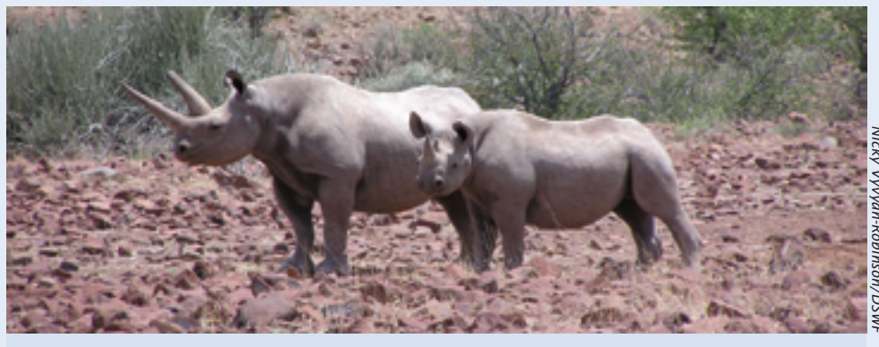
Rhinos should be relocated to protected areas in their historic range—not slaughtered for "sport".

International attention to the plight of Africa's lions is essential for their long-term survival.