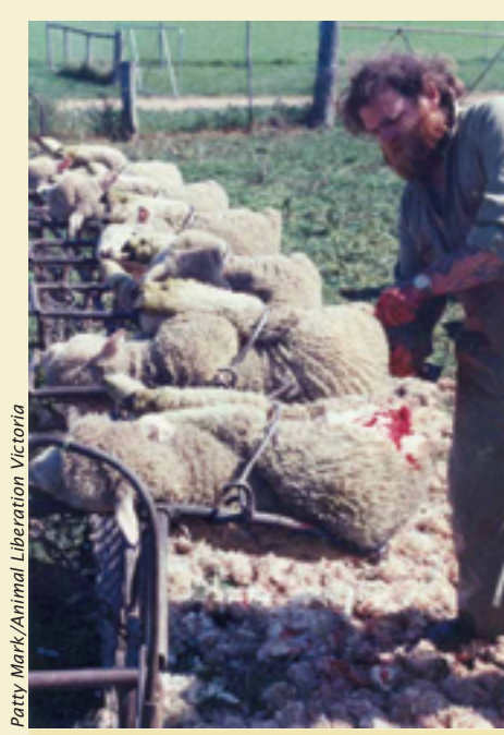
large chunk of skin brutally cut off from under their tails to prevent blowfly strike.

AWI's criteria require that husbandry, housing and diet allow the animals to behave naturally. Unlike agribusiness, which views animals as inanimate objects and cruelly subjects them to industrial systems that lower production costs and maximize profits to the animals' detriment, AWI requires that farms accommodate the animals' needs. Animals must be able to perform behaviors essential to