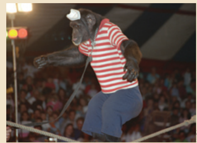
Regular beatings turn innocent chimps into circus performers.

Horrifying tales of abusive training—punching, kicking, beating with rocks, sticks, and broom handles—reveal an industry that bases "training" on fear and physical and psychological domination. Such violence is reprehensible.