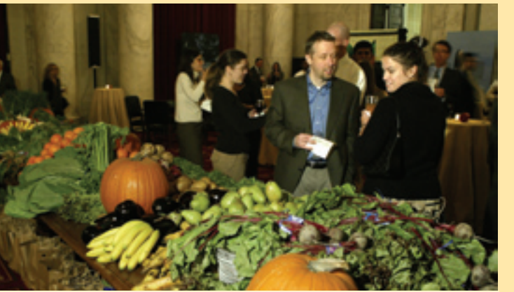
Whole Foods provided a cornucopia of fresh fruits and vegetables, and guests were able to fill a grab bag with wholesome goodies

Eisnitz's courage in helping all animals, but her compassion for people as well.