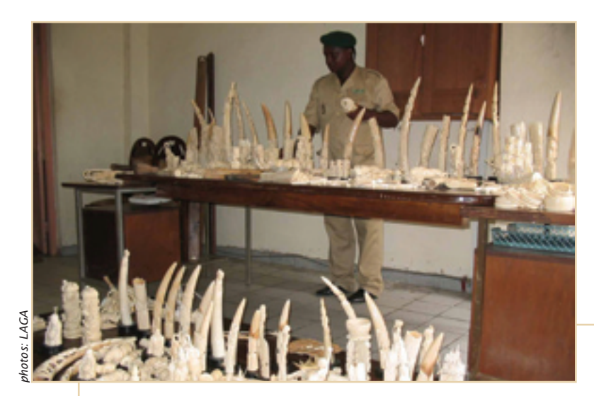
Results of an undercover operation into Chinese involvement in illegal ivory trading.