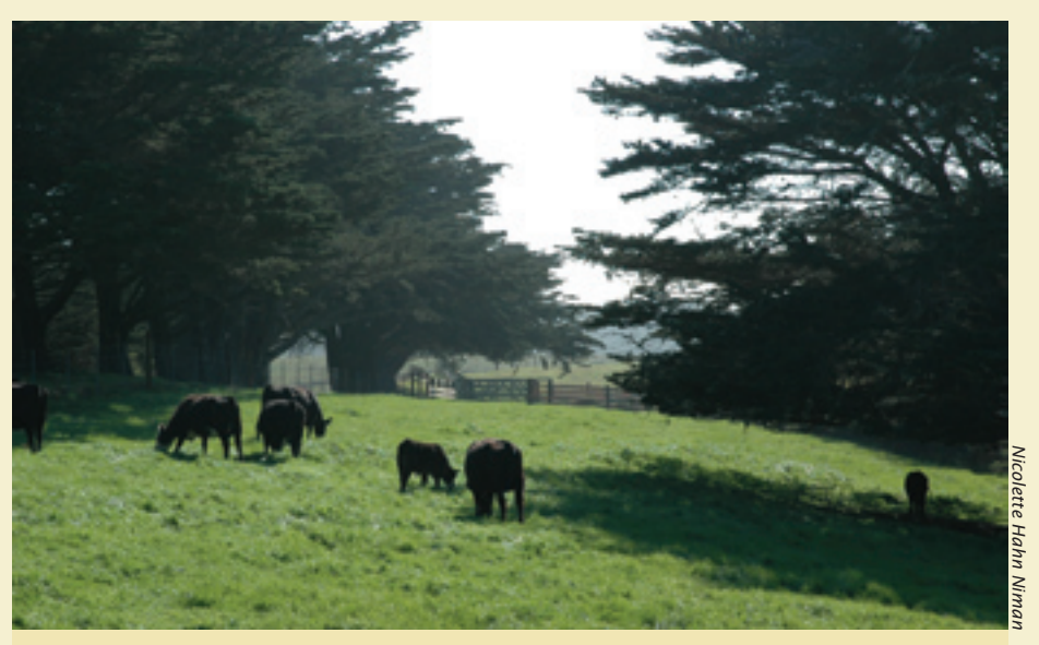
Quality pasture offers enrichment and nutrients. Among other things, AWI's standards ensure cattle can graze, exercise, access shade and rest at will.

their physiological and psychological health and well-being.